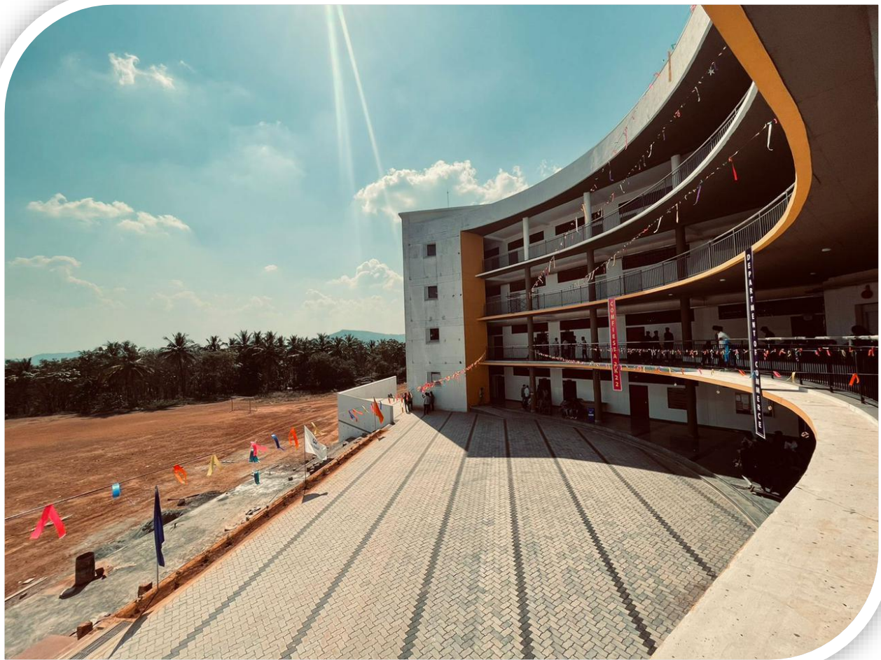
Al Shifa College of Arts and Science, Perinthalmanna.